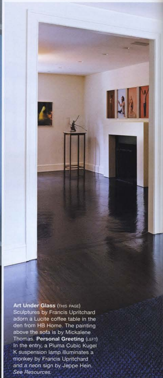
Art Under Glass (THIS PAGE) Sculptures by Francis Upritchard adorn a Lucite coffee table in the den from HB Home. The painting above the sofa is by Mickalene Thomas. Personal Greeting (LEFT) In the entry, a Pluma Cubic Kugel K suspension lamp illuminates a monkey by Francis Upritchard and a neon sign by Jeppe Hein. See Resources.

CAREFULLY CURATED ART SETS THE TONE AND PROVIDES LAYERING IN THIS GREENWICH HOME