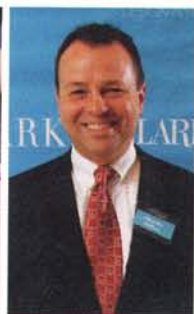
CHARLES HILTON CHARLES HILTON ARCHITECTS (FORMERLY OF HILTON- VANDERHORN ARCHITECTS) ARCHITECTURE