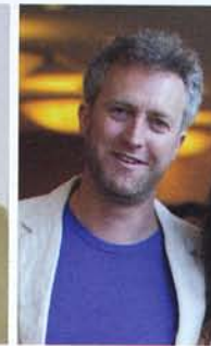
BEN YOUNG BEN YOUNG LANDSCAPE DESIGN LANDSCAPE