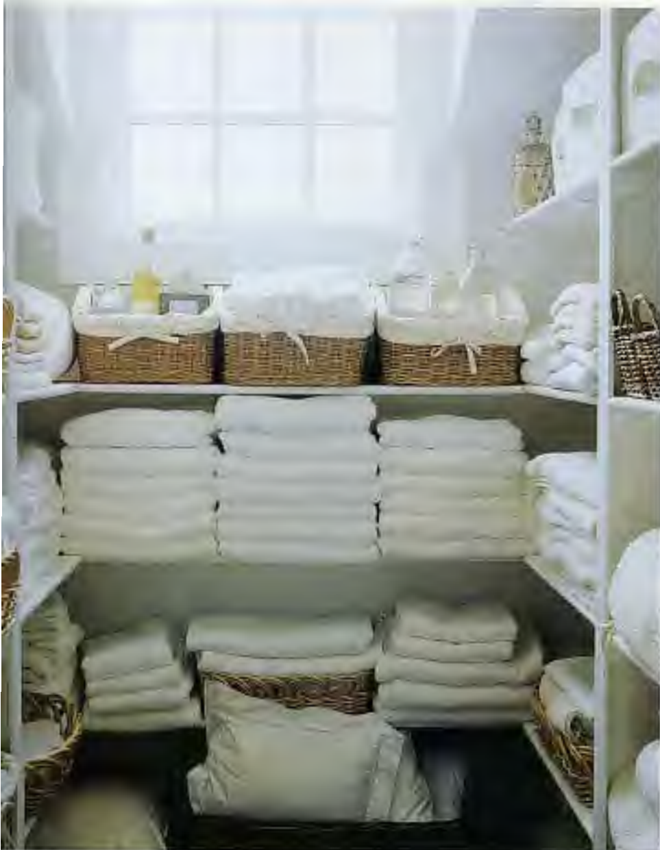
Linens 'n Things | A dazzling linen closet (1777) near the master bedroom features a French door to show off its wares. Bath Room | The spacious master bathroom (1812, 1817) features more Donald Brundheim photos. Year Round | In the serene master bedroom (opposite), white slipcovered sofas flank a table made from an African drum. See Resources.