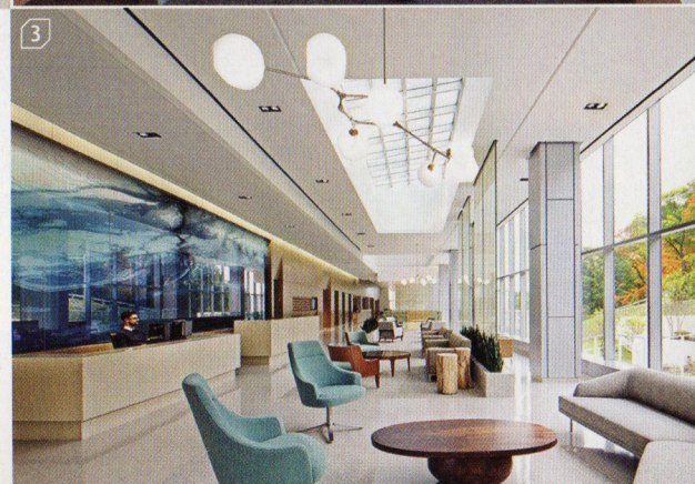
1. EwingCole's cancer center at Upstate University Hospital, State University of New York, in Syracuse. 2. The Children's Hospital of Philadelphia's specialty care and surgery center in King of Prussia by the same firm. 3. Its Memorial Sloan Kettering Cancer Center in Harrison, New York.