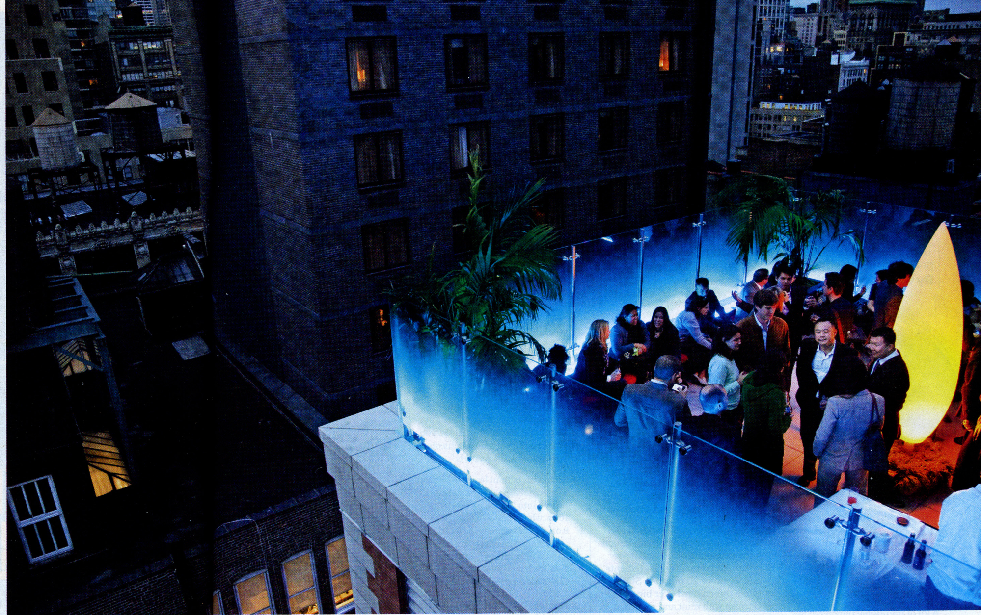
Glass Bar at Hotel Indigo

The Sky Room at the Fairfield Inn & Suites by Marriott Times Square 330 W. 40th St., nr. Ninth Ave.; 212-967-9494 The highest and biggest of its peers, this just-opened bi-level lounge has five distinct spaces, including two sizable terraces upstairs. Party-size cabanas dominate the southern terrace, while the north-facing veranda is all-weather with a retractable roof.